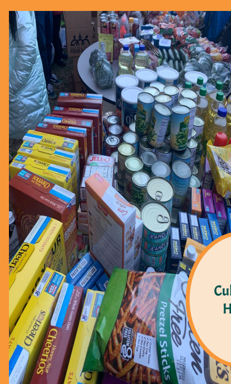
Culture of Health