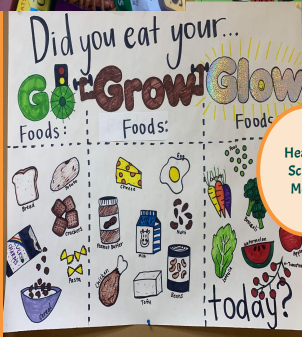
Healthy School Meals